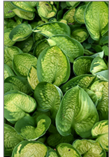
Rainforest Sunrise Hosta foliage