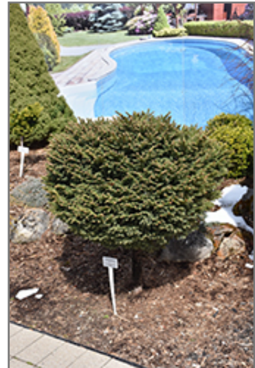
Little Gem Spruce (tree form)