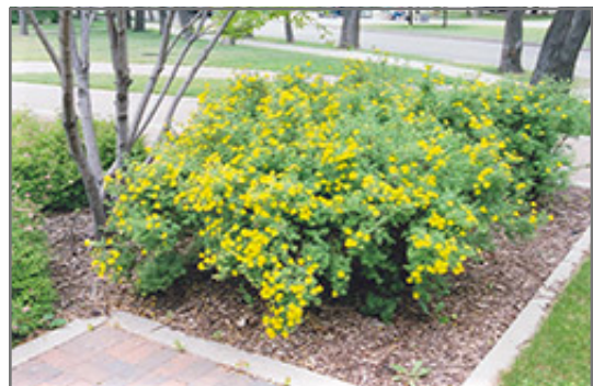
Coronation Triumph Potentilla in bloom