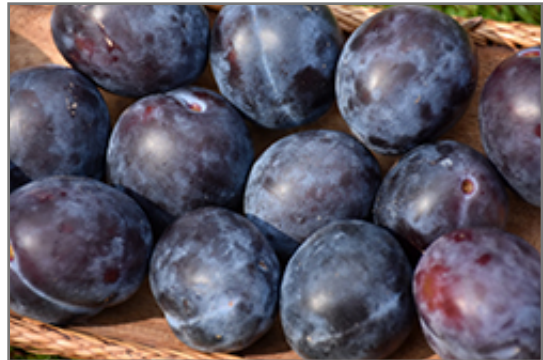
Mount Royal Plum fruit