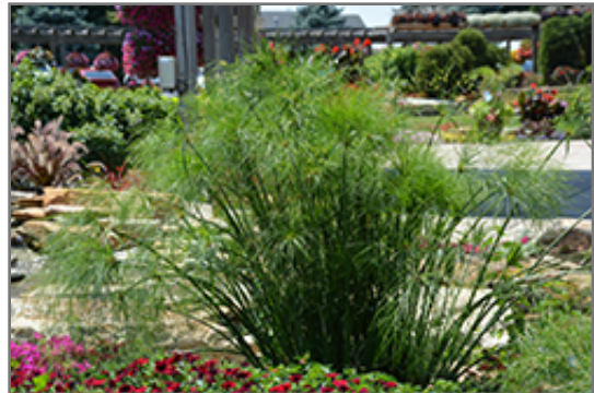
King Tut Egyptian Papyrus