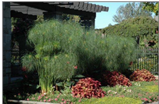
King Tut Egyptian Papyrus