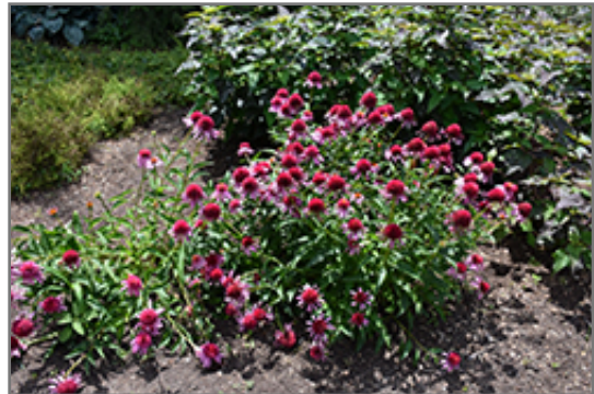
Double Scoop Bubble Gum Coneflower in bloom