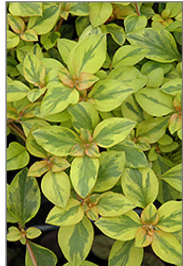
Walkabout Sunset Loosestrife foliage