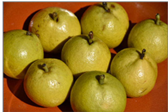
Golden Spice Pear fruit