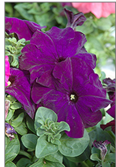
Dreams Midnight Petunia flowers