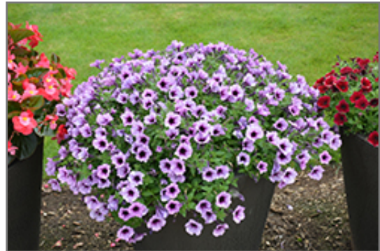
Supertunia Bordeaux Petunia in bloom

Supertunia Bordeaux Petunia will grow to be about 10 inches tall at maturity, with a spread of 24 inches. When grown in masses or used as a bedding plant, individual plants should be spaced approximately 20 inches apart. Its foliage tends to remain low and dense right to the ground. This fast-growing annual will normally live for one full growing season, needing replacement the following year.