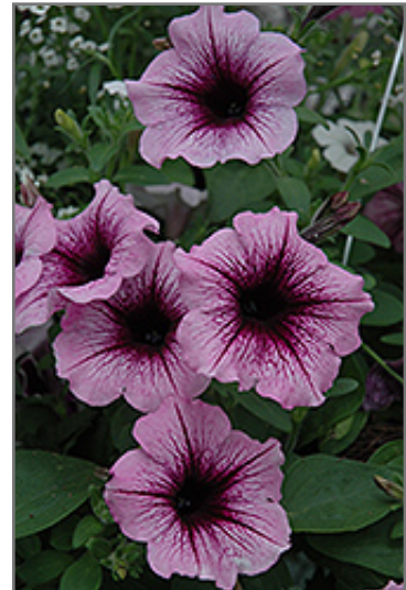
Supertunia Bordeaux Petunia flowers

Supertunia Bordeaux Petunia is recommended for the following landscape applications;