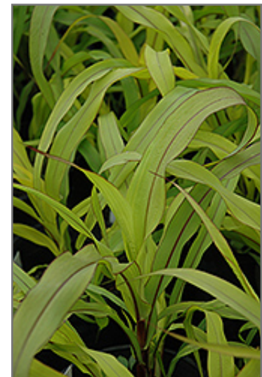
Jester Millet foliage