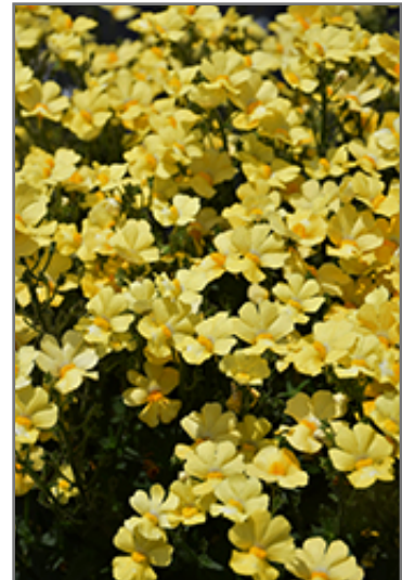
Sunsatia Lemon Nemesia flowers