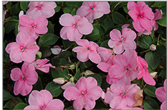
Super Elfin XP Pink Impatiens flowers

Super Elfin XP Pink Impatiens is recommended for the following landscape applications;