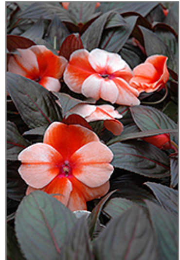
Celebrette Orange Stripe New Guinea Impatiens flowers

Celebrette Orange Stripe New Guinea Impatiens is recommended for the following landscape applications;