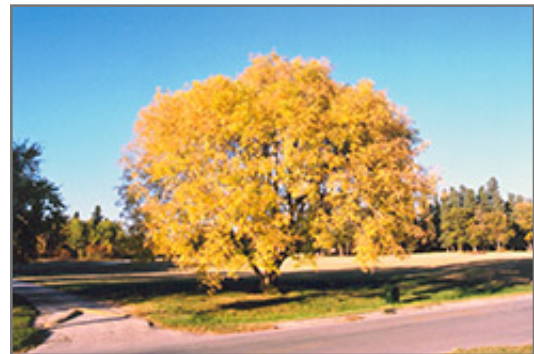
Boxelder in fall

Boxelder is recommended for the following landscape applications;