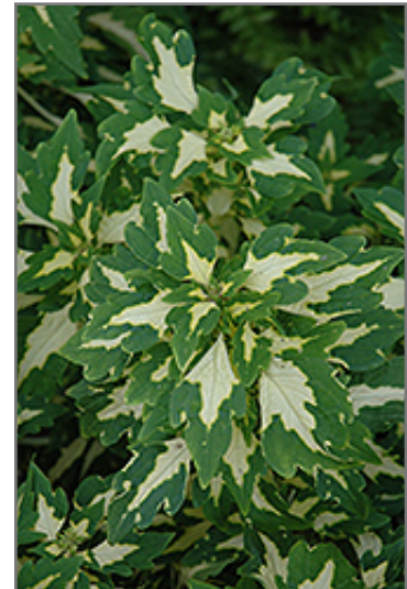
ColorBlaze Alligator Tears Coleus foliage