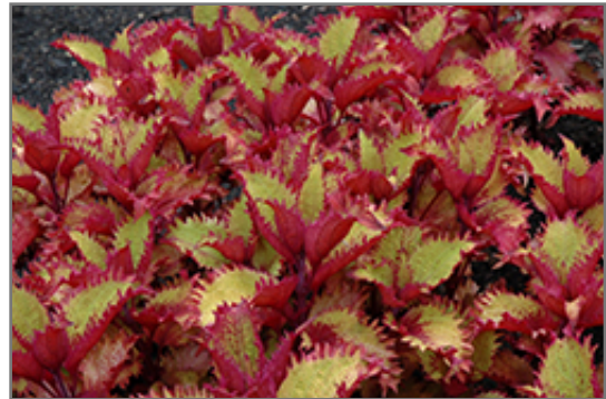
Henna Coleus foliage