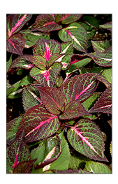
Magilla Perilla foliage