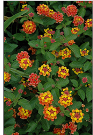
Landmark Citrus Lantana flowers