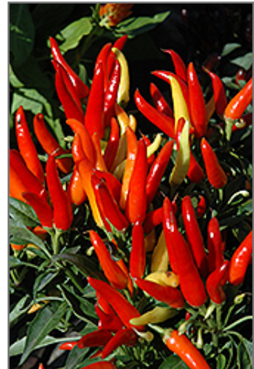
Chilly Chili Ornamental Pepper fruit