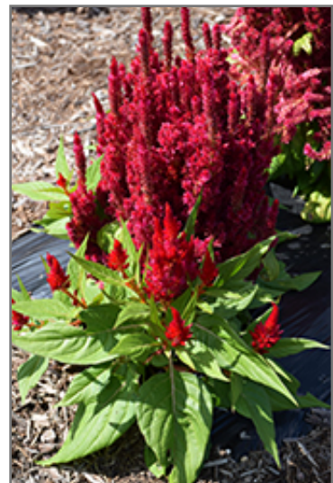
Fresh Look Red Celosia in bloom