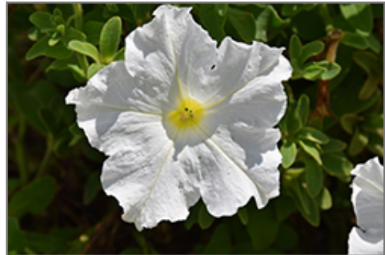
Pretty Flora White Petunia flowers