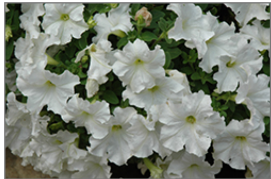
Pretty Flora White Petunia flowers