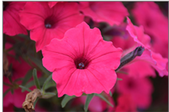
Supertunia Vista Fuchsia Petunia flowers

Supertunia Vista Fuchsia Petunia is recommended for the following landscape applications;