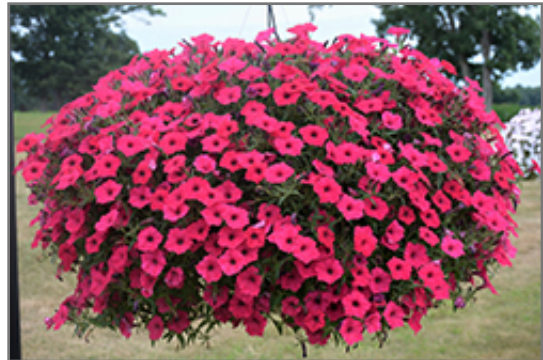
Supertunia Vista Fuchsia Petunia in bloom