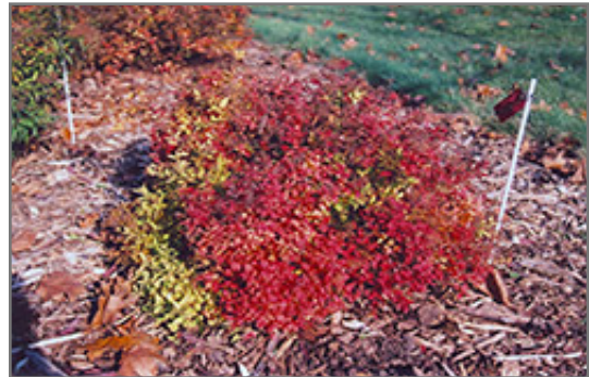
Dakota Goldcharm Spirea in fall

This shrub should only be grown in full sunlight. It prefers to grow in average to moist conditions, and shouldn't be allowed to dry out. It is not particular as to soil type or pH. It is highly tolerant of urban pollution and will even thrive in inner city environments. This is a selected variety of a species not originally from North America.