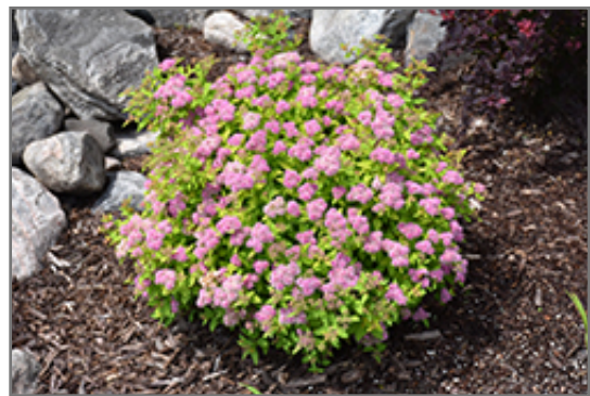
Dakota Goldcharm Spirea in bloom