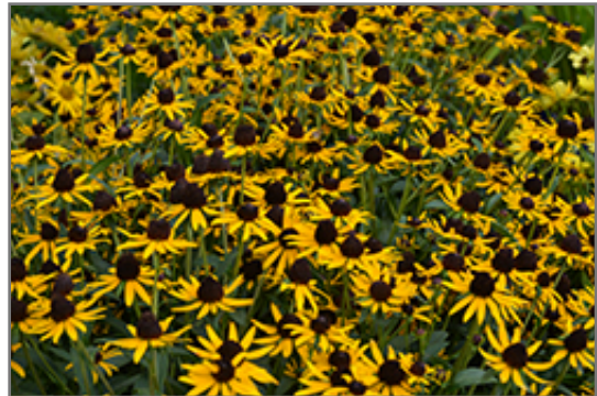
Little Goldstar Coneflower flowers