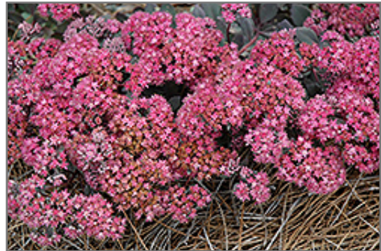
Dazzleberry Stonecrop flowers

Dazzleberry Stonecrop is a dense herbaceous perennial with an upright spreading habit of growth. Its medium texture blends into the garden, but can always be balanced by a couple of finer or coarser plants for an effective composition.