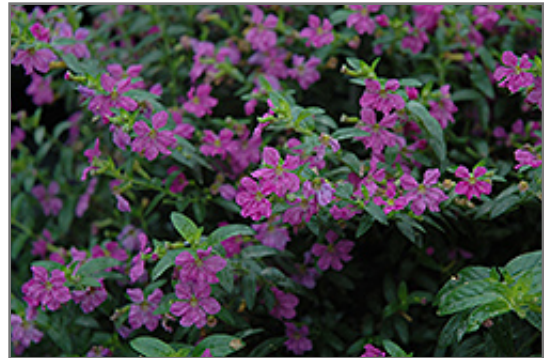
Allyson Mexican Heather flowers

Allyson Mexican Heather is recommended for the following landscape applications;