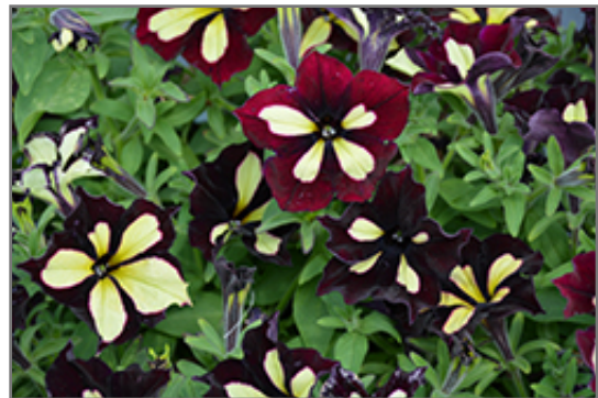
Crazytunia Star Jubilee Petunia flowers