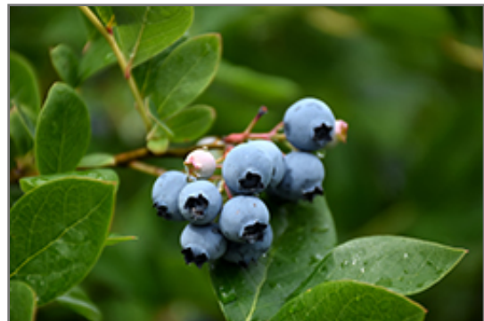
Northcountry Blueberry fruit

Northcountry Blueberry features dainty clusters of white bell-shaped flowers with shell pink overtones hanging below the branches in mid spring. It has green deciduous foliage. The glossy oval leaves turn an outstanding scarlet in the fall. It features an abundance of magnificent blue berries in mid summer.