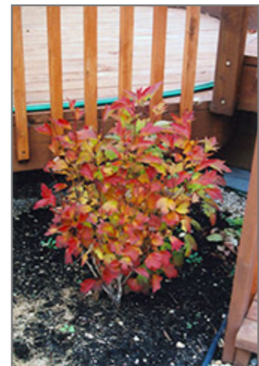
Compact Highbush Cranberry in fall