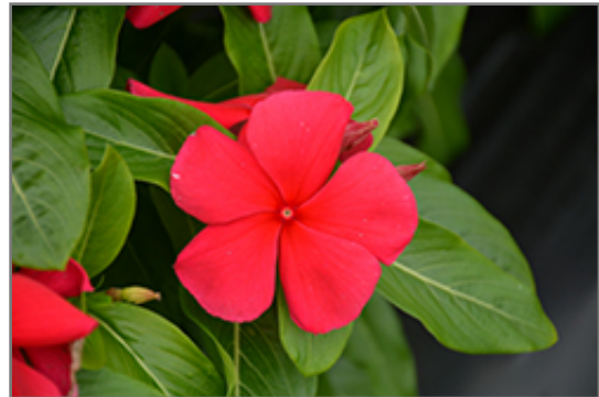
Titan Dark Red Vinca flowers

This plant will require occasional maintenance and upkeep, and should not require much pruning, except when necessary, such as to remove dieback. It is a good choice for attracting butterflies to your yard, but is not particularly attractive to deer who tend to leave it alone in favor of tastier treats. It has no significant negative characteristics.