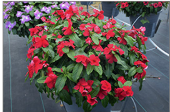
Titan Dark Red Vinca in bloom

Titan Dark Red Vinca is a fine choice for the garden, but it is also a good selection for planting in outdoor containers and hanging baskets. It is often used as a 'filler' in the 'spiller-thriller-filler' container combination, providing a mass of flowers against which the thriller plants stand out. Note that when growing plants in outdoor containers and baskets, they may require more frequent waterings than they would in the yard or garden.