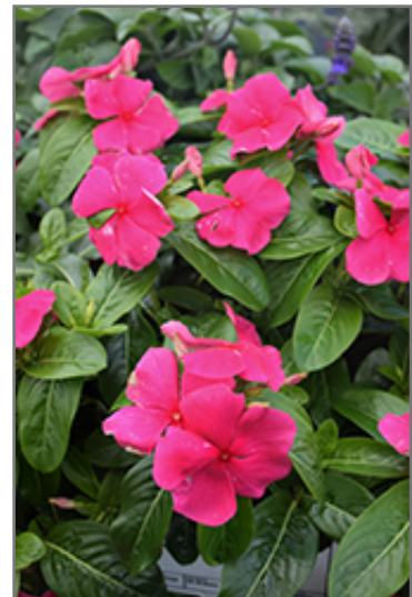
Titan Punch Vinca flowers

This plant will require occasional maintenance and upkeep, and should not require much pruning, except when necessary, such as to remove dieback. It is a good choice for attracting butterflies to your yard, but is not particularly attractive to deer who tend to leave it alone in favor of tastier treats. It has no significant negative characteristics.