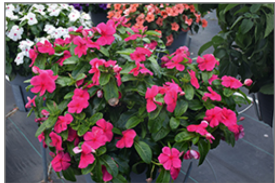
Titan Punch Vinca in bloom

Titan Punch Vinca is a fine choice for the garden, but it is also a good selection for planting in outdoor containers and hanging baskets. It is often used as a 'filler' in the 'spiller-thriller-filler' container combination, providing a mass of flowers against which the thriller plants stand out. Note that when growing plants in outdoor containers and baskets, they may require more frequent waterings than they would in the yard or garden.