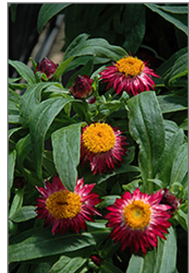
Mohave Dark Red Strawflower flowers