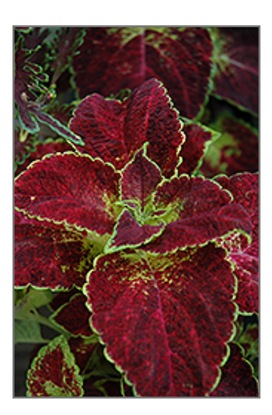
ColorBlaze Dipt in Wine Coleus foliage