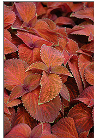
Wizard Sunset Coleus foliage

This is a relatively low maintenance plant. The flowers of this plant may actually detract from its ornamental features, so they can be removed as they appear. Deer don't particularly care for this plant and will usually leave it alone in favor of tastier treats. It has no significant negative characteristics.