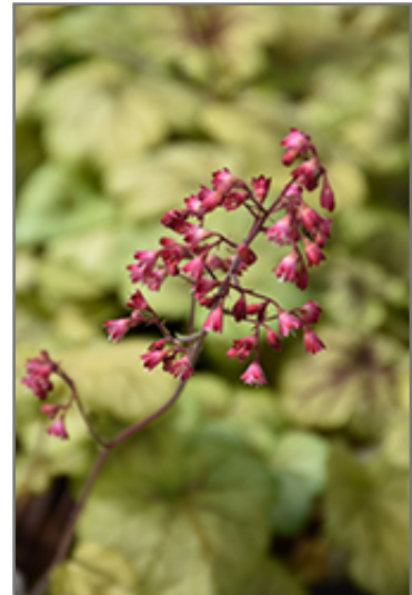
Circus Coral Bells flowers

This plant is not reliably hardy in our region, and certain restrictions may apply; contact the store for more information.