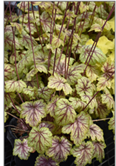
Circus Coral Bells foliage

Circus Coral Bells is recommended for the following landscape applications;