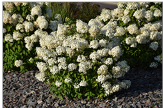
Bobo Hydrangea in bloom