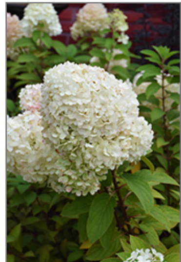
Bobo Hydrangea flowers