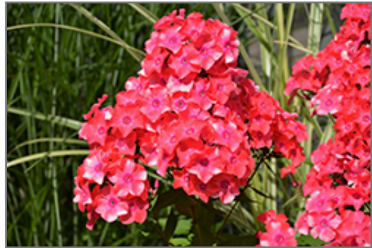
Flame Coral Garden Phlox flowers

Flame Coral Garden Phlox is a dense herbaceous perennial with an upright spreading habit of growth. Its medium texture blends into the garden, but can always be balanced by a couple of finer or coarser plants for an effective composition.