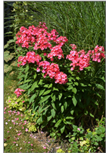
Flame Coral Garden Phlox in bloom