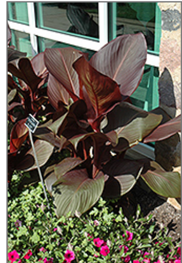
Tropicanna Black Canna

This plant is native to the tropics and prefers growing in moist environments with evenly warm conditions all year round. In our climate, it is usually grown as an outdoor annual in the garden or in a container. If you want it to survive the winter, it can be brought in to the house and provided with special care, and then returned to the garden the following season. In its preferred tropical habitat, it can grow to be around 5 feet tall at maturity, with a spread of 24 inches. However, when grown as an annual or when overwintered indoors, it can be expected to perform differently, and its exact height and spread will depend on many factors; you may wish to consult with our experts as to how it might perform in your specific application and growing conditions.