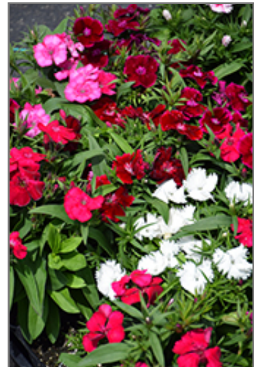
Floral Lace Mix Pinks flowers