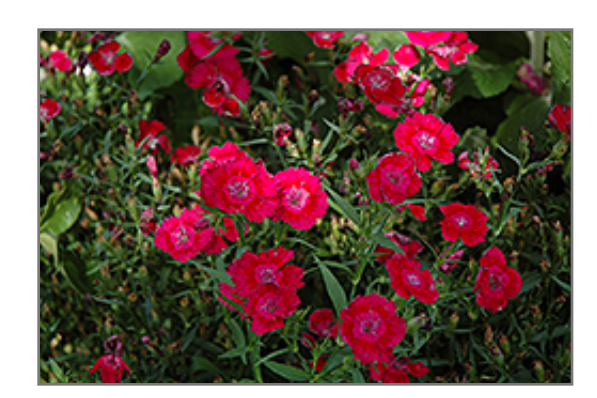
Ideal Select Red Pinks flowers

Ideal Select Red Pinks is recommended for the following landscape applications;