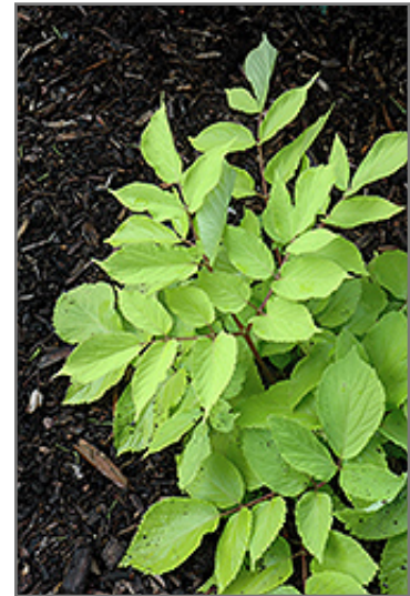
Sun King Japanese Spikenard foliage

This plant performs well in both full sun and full shade. It prefers to grow in average to moist conditions, and shouldn't be allowed to dry out. It is not particular as to soil type or pH. It is highly tolerant of urban pollution and will even thrive in inner city environments. This is a selected variety of a species not originally from North America.