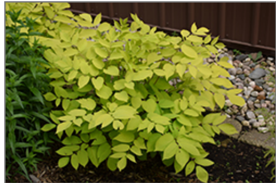
Sun King Japanese Spikenard

This plant will require occasional maintenance and upkeep, and is best cut back to the ground in late winter before active growth resumes. It is a good choice for attracting birds and bees to your yard. Gardeners should be aware of the following characteristic(s) that may warrant special consideration;