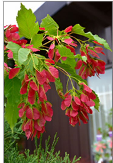
Ruby Slippers Amur Maple fruit