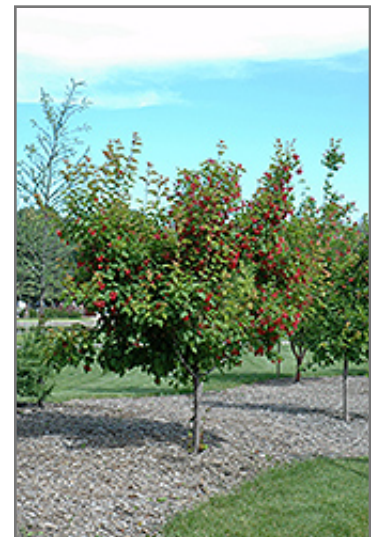
Ruby Slippers Amur Maple