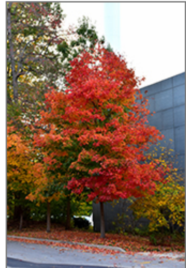
Fall Fiesta Sugar Maple in fall

Fall Fiesta Sugar Maple is recommended for the following landscape applications;