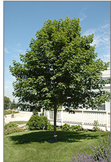
Fall Fiesta Sugar Maple

This plant is not reliably hardy in our region, and certain restrictions may apply; contact the store for more information.