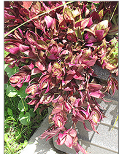
Purple Wandering Jew

Purple Wandering Jew is recommended for the following landscape applications;