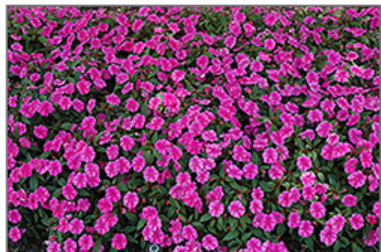
Bounce Pink Flame Impatiens in bloom