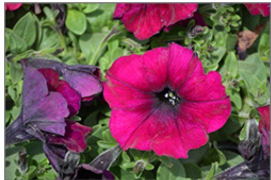
Easy Wave Burgundy Velour Petunia flowers