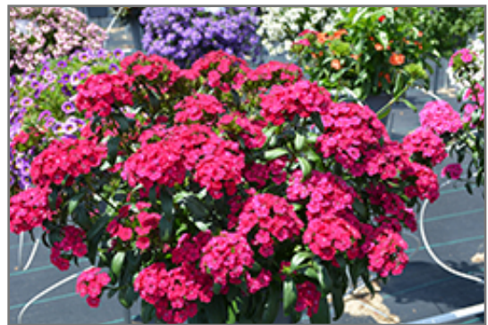
Jolt Cherry Hybrid Pinks in bloom