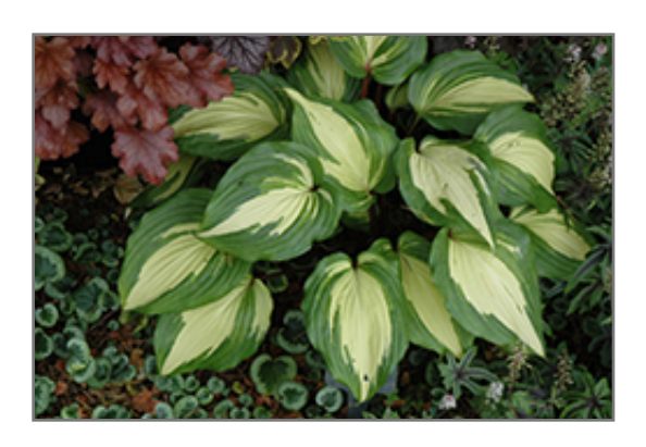
Raspberry Sundae Hosta