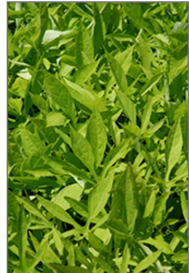
SolarPower Lime Sweet Potato Vine foliage